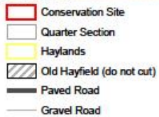
Boulder Creek Uplands Conservation Site (NW, SW-35-71-20-W5M)